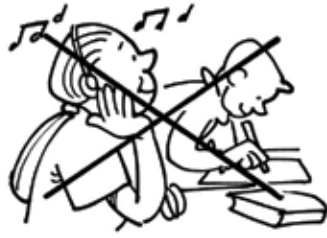
1. Don't listen to music in class!